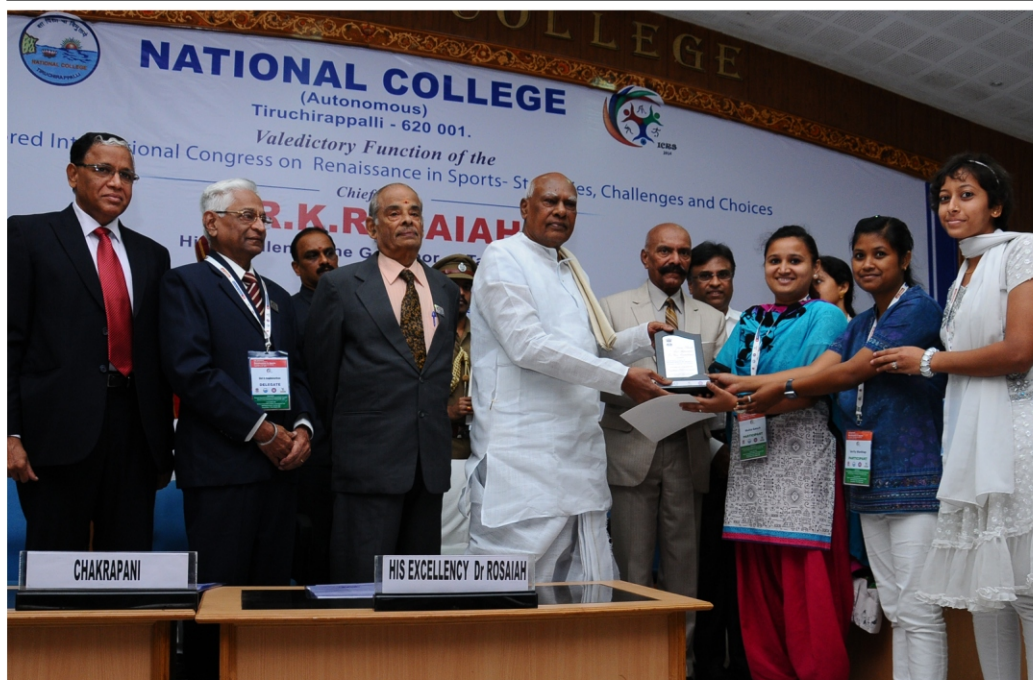
Governor K. Rosaiah presenting the best paper award during the International Congress on Renaissance in Sports - ICRS 2014

"That alone is knowledge which liberates"